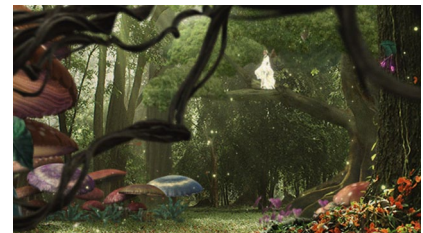
PEPSODENT Herbal Toothpaste