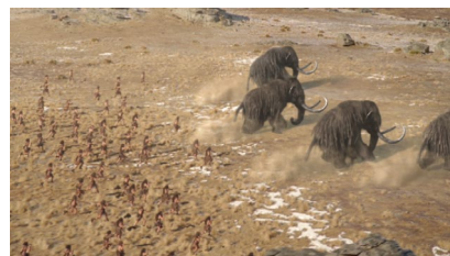
SUNTORY Boss Coffee