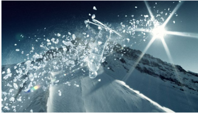
WINTER OLYMPICS 2010 Foxtel Opener

Watch the videos online at monkeyhut.com.au