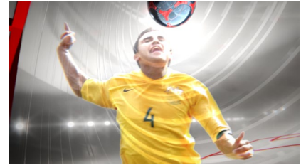
FOXSPORTS Football Opener