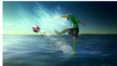
TCL B68 LCD TV