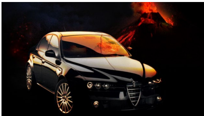
ALFA ROMEO 159