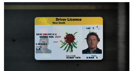
RTA Double Demerits